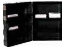
Detachable shelves to hold brochures, demo products and drinks.

Expand PodiumCases is perfect to transport Expand 2000, Expand MediaFabric and our other products.