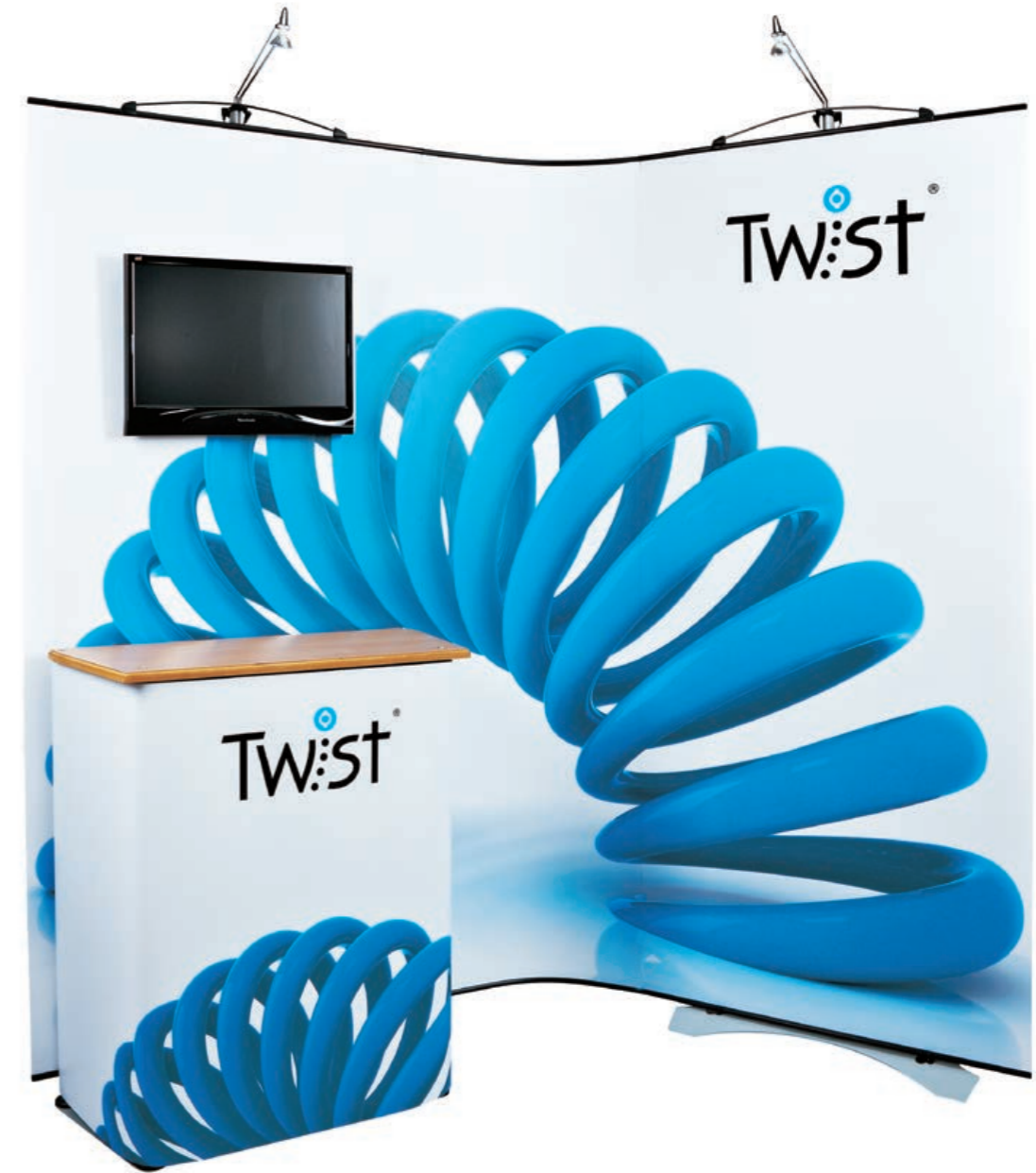
Image shows Twist 3 Panel kit including Media upgrade and Twist Counter Accessory (see page 17 for more info)